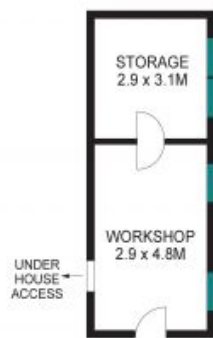
Lower Ground Level