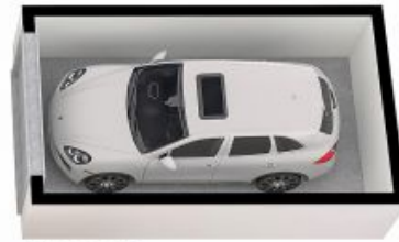
Basement (Not in Position)