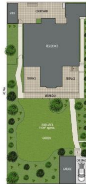
18.2m HAZELBANK ROAD SITE PLAN