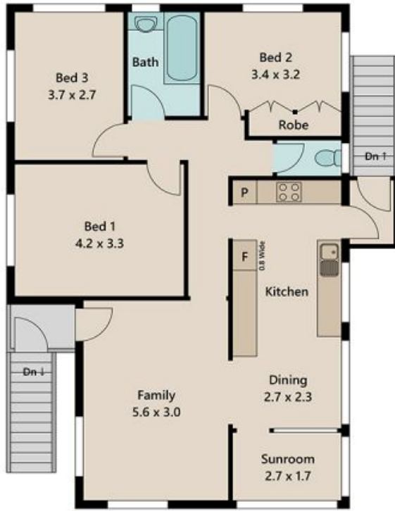
FIRST FLOOR 95 m 2