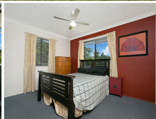
1 Mack Court BORONIA HEIGHTS, QLD 3 2