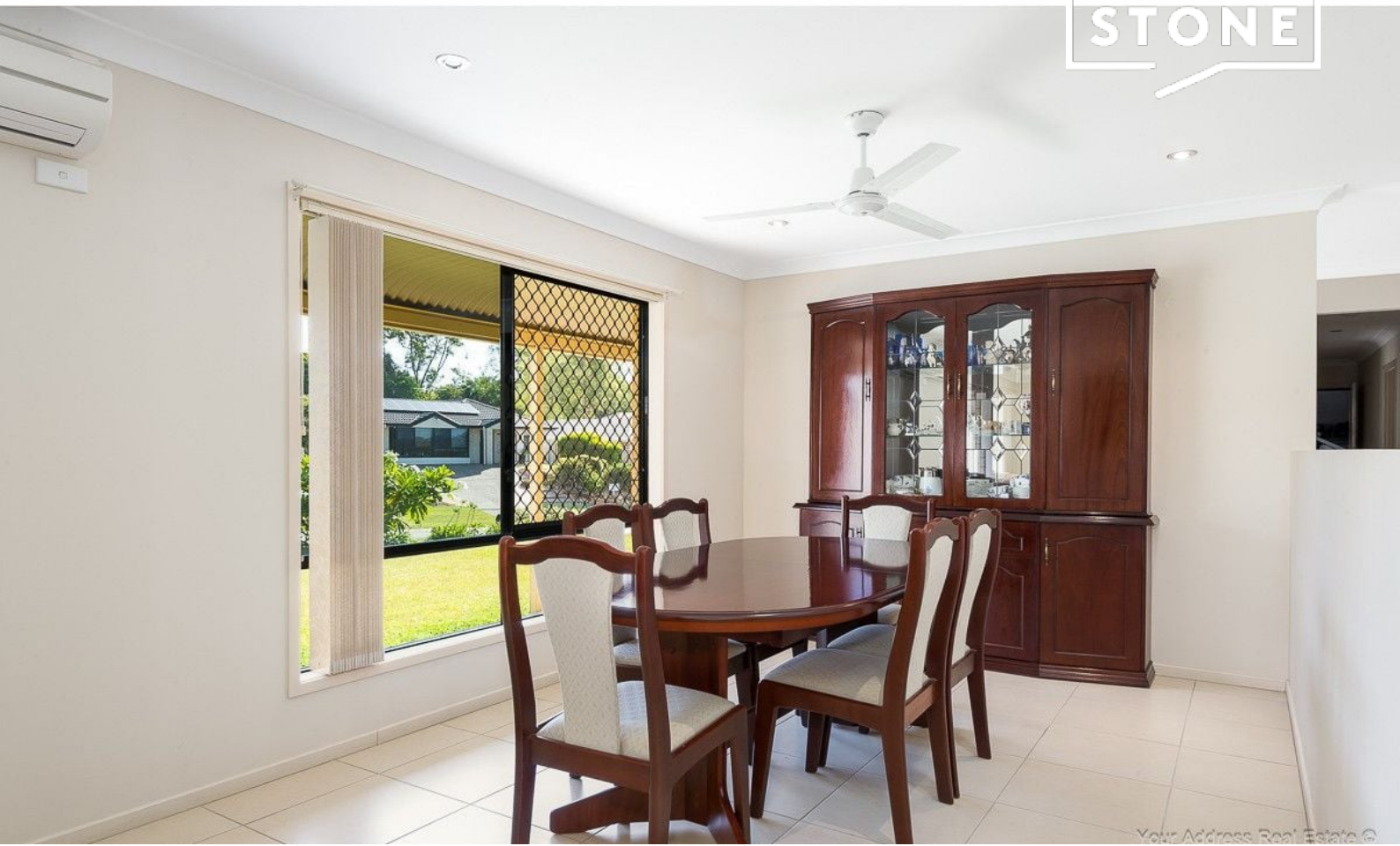
Your Address Real Estate ©