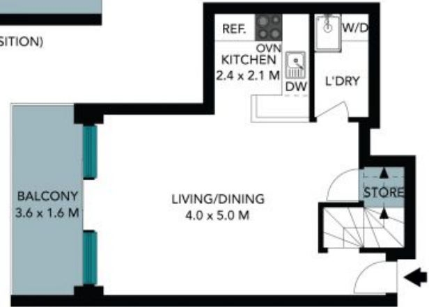
Lower Level Floor