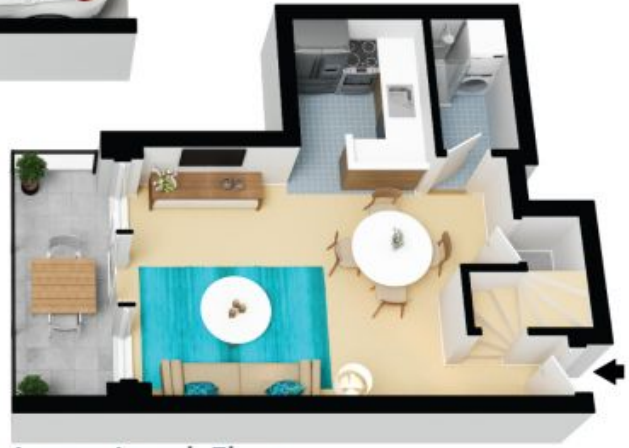
Lower Level Floor