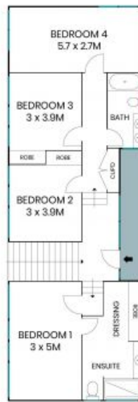
Upper Level (Entry Level)