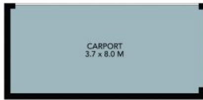
CARPORT 3.7 x 8.0 M