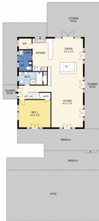
MAIN HOUSE GROUND FLOOR