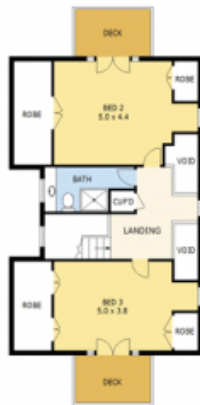
MAIN HOUSE FIRST FLOOR