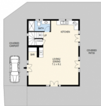
STUDIO GROUND FLOOR