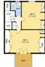
STUDIO FIRST FLOOR