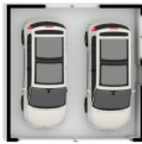
Garage 5.2 x 5.2

Please note: Floorplan measurements are a guide only. All dimensions are approximate in their distance and volume.