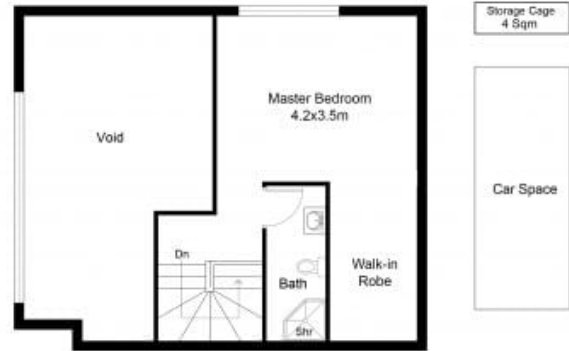
MEZZANINE FLOOR PLAN

This floor plan including furniture, fixture measurements and dimensions are approximate and for illustrative purposes only. BoxBrownie.com gives no guarantee, warranty or representation as to the accuracy and layout. All enquiries must be directed to the agent, vendor or party representing this floor plan.