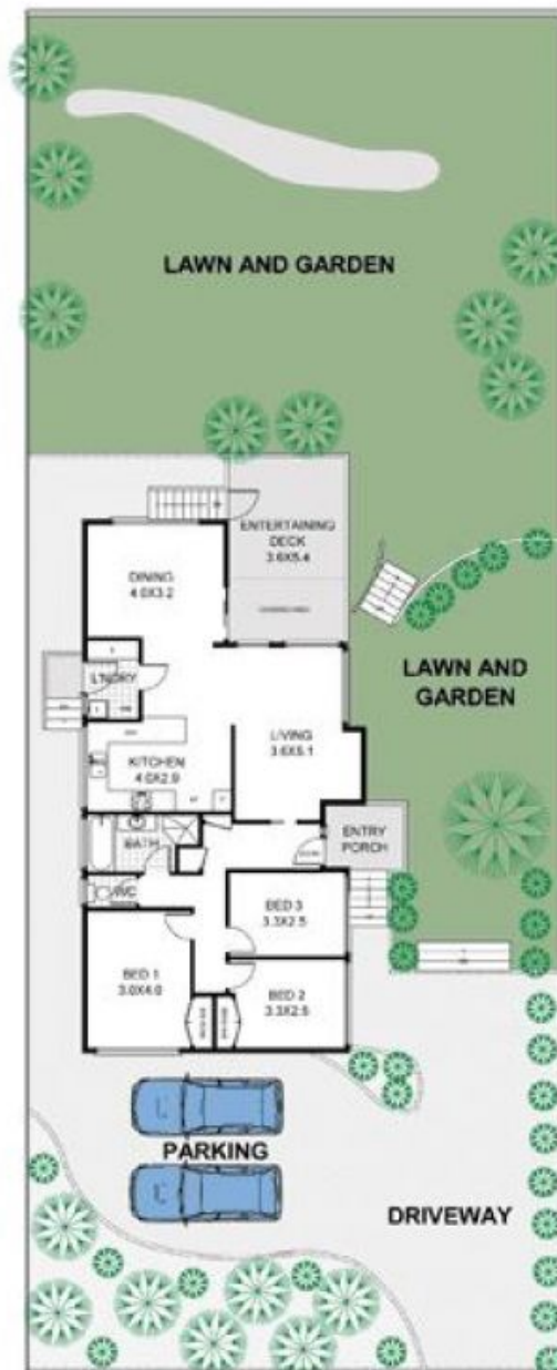
GENERAL PLAN - MAIN LIVING LEVEL AND SITE PLAN (NOT TO SAME SCALE)