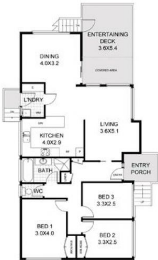
ENTRY LEVEL - MAIN LIVING