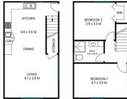
Detached Ground Level