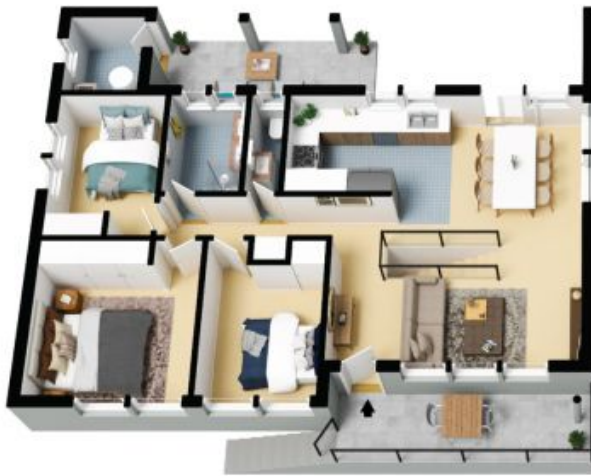
Elevated Ground Floor