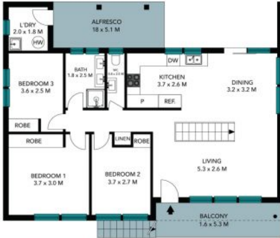
Elevated Ground Floor