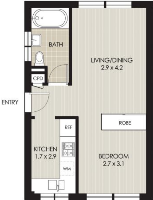
APARTMENT FLOOR PLAN