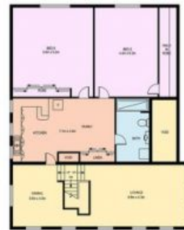
LEVEL 1 FLOOR PLAN