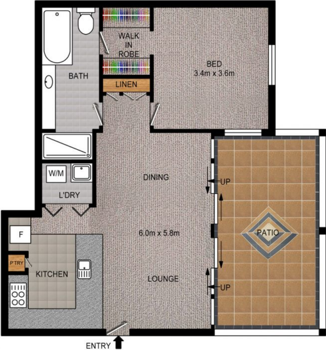
ENTRY ↑ GROUND FLOOR PLAN