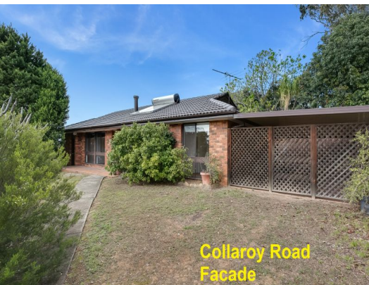
Collaroy Road Facade