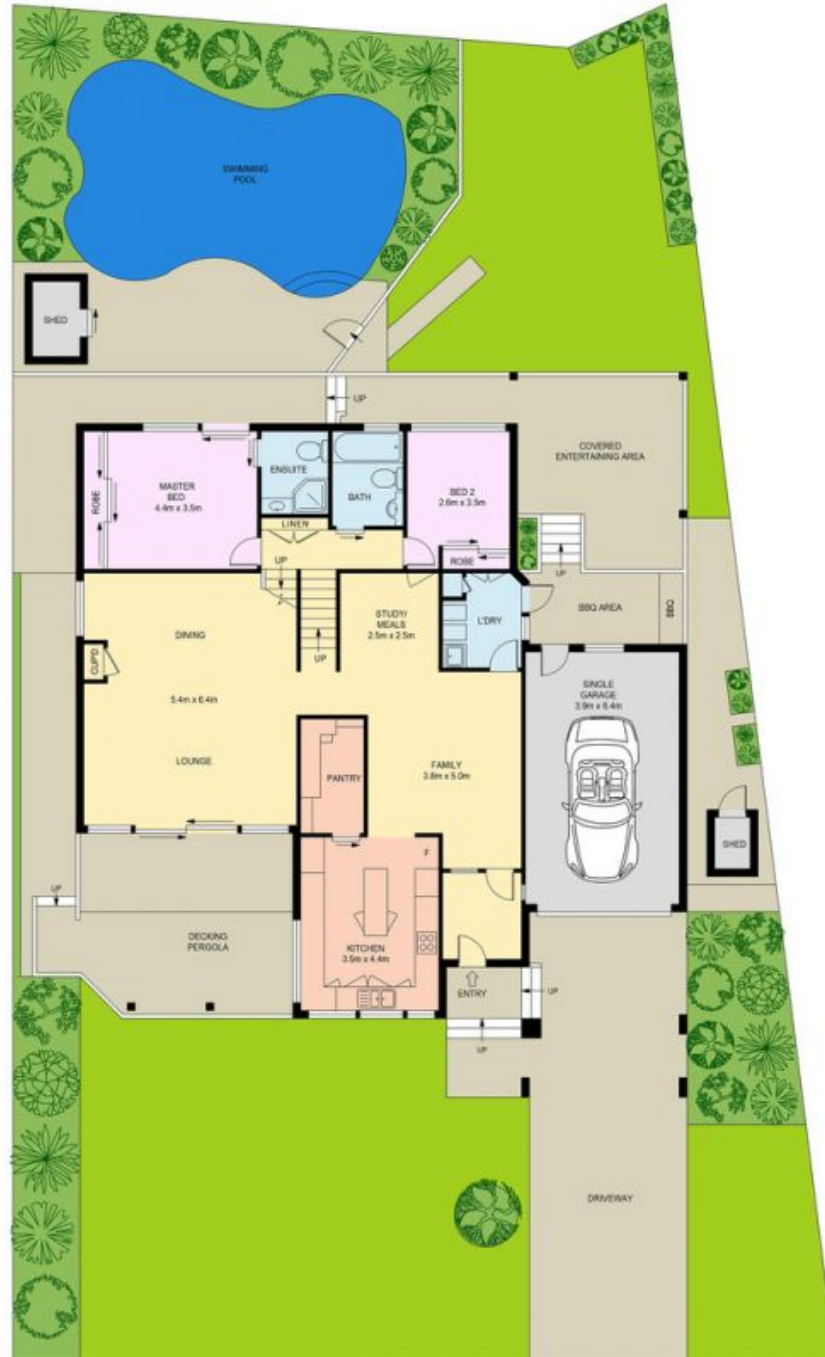
LEVEL 1 FLOOR PLAN