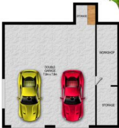
LOWER LEVEL FLOOR PLAN