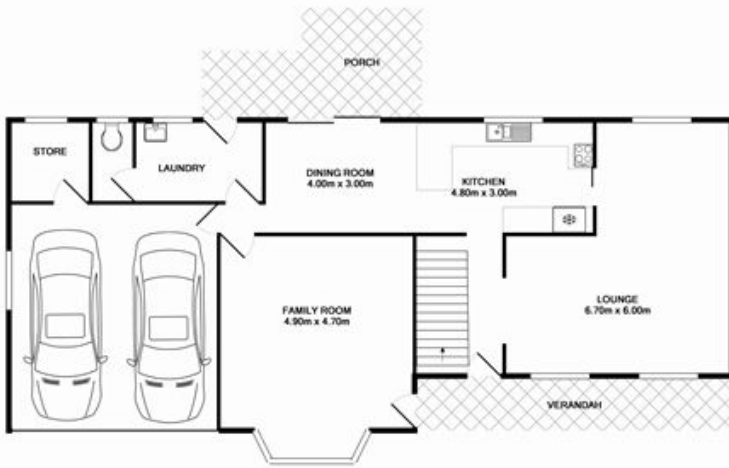
GROUND FLOOR APPROX. FLOOR AREA 142.2 SQ.M. (1586 SQ.FT.)