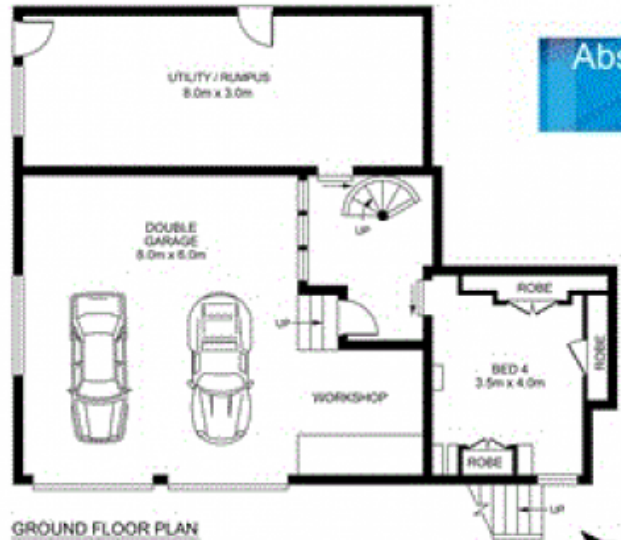
GROUND FLOOR PLAN GROSS INTERNAL FLOOR AREA 88 SQ.M. APPROX. GROSS FLOOR AREA 279 SQ.M. / 3003 SQ.FT.