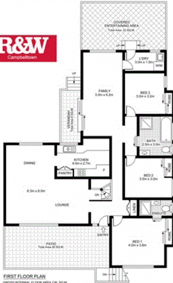
FIRST FLOOR PLAN GROSS INTERNAL FLOOR AREA 136 SQ.M. PATIO AREA 26 SQ.M. VERANDAH AREA 6 SQ.M. COVERED ENTERTAINING AREA 23 SQ.M.