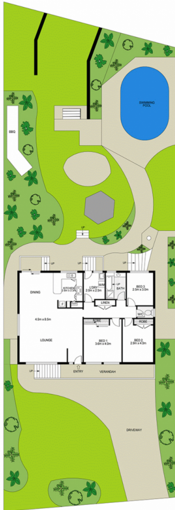
TOP FLOOR PLAN