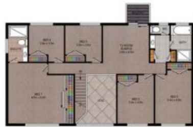
TOP FLOOR PLAN