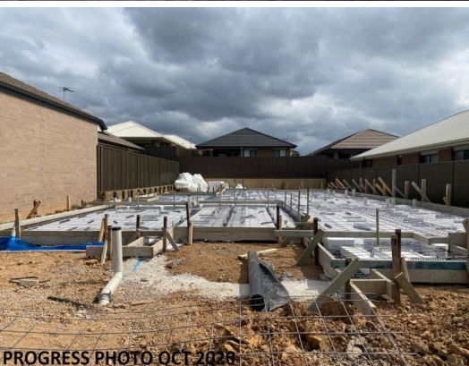
PROGRESS PHOTO OCT 2020