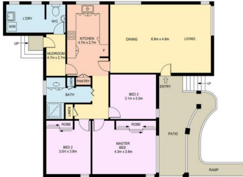
LEVEL 1 FLOOR PLAN