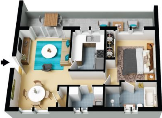
Apartment Floor Plan