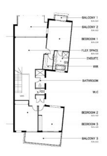
LOT 3010 FIRST FLOOR

280080-8,000 (1988) #8607 (0480) #801-00809 #80 00888 PUID 50-008 FUID (1988) FUID #840287 | 244 MACCERY 2 844