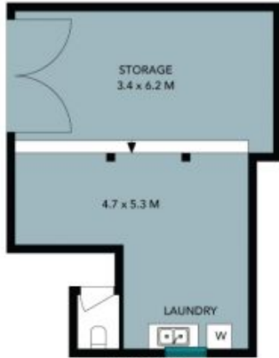
UNDER HOUSE (NOT IN POSITION)