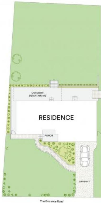
The Entrance Road