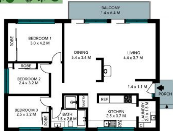
Upper Ground Level

Internal Living: 94 sqm External Living: 12 sqm Total Living Area: 106 sqm