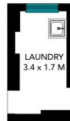
(COMMON LAUNDRY) Ground Level