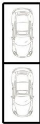
Double Underground Carpark 9.0m x 2.4m