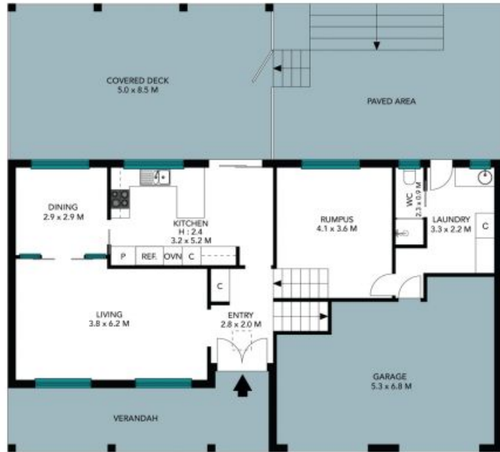
Main Floor/Lower Level