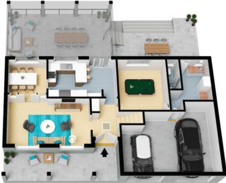
Main Floor/Lower Level