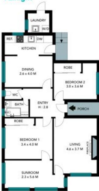
APARTMENT 1 GROUND FLOOR

Internal Living: 195 sqm External Living: 8 sqm Total Living Area: 203 sqm