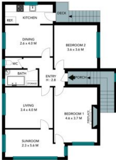
APARTMENT 2 1ST FLOOR

Internal Living: 195 sqm External Living: 8 sqm Total Living Area: 203 sqm