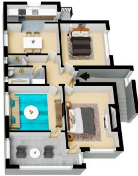
APARTMENT 2 1ST FLOOR

Internal Living: 195 sqm External Living: 8 sqm Total Living Area: 203 sqm