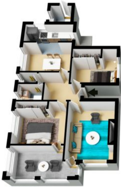
APARTMENT 1 GROUND FLOOR

Internal Living: 195 sqm External Living: 8 sqm Total Living Area: 203 sqm