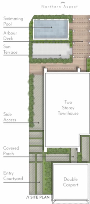
// SITE PLAN MAGNOLI CIRCUIT