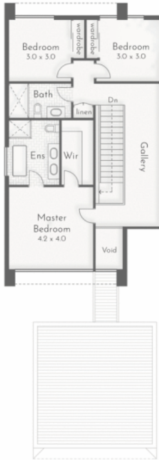
// FLOOR PLAN First Floor