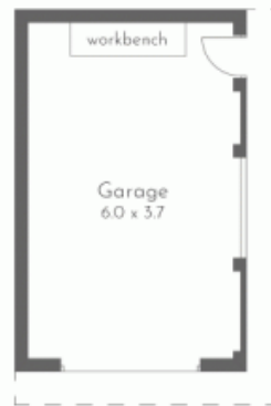
:: FLOOR PLAN