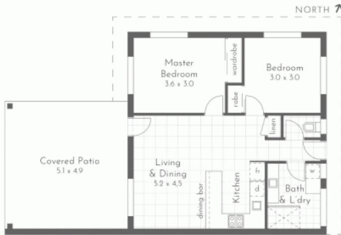
:: FLOOR PLAN