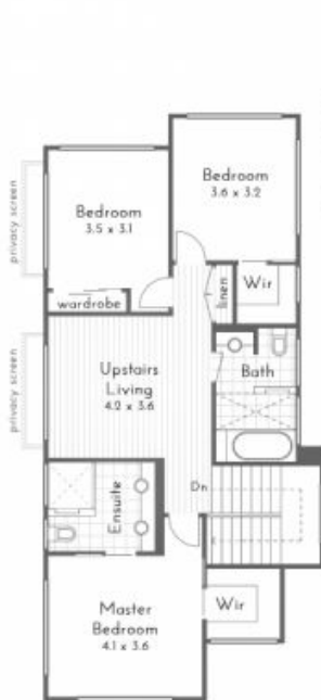
FLOOR PLAN First Floor - 2.7m Ceiling