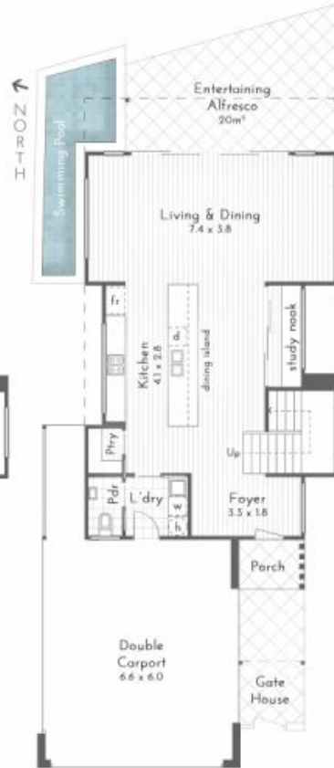
FLOOR PLAN First Floor - 2.6m Ceiling