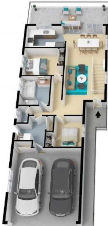
LOWER LEVEL 1

Internal Living: 165 sqm approx External Living: 67 sqm approx Total Living Area: 232 sqm approx