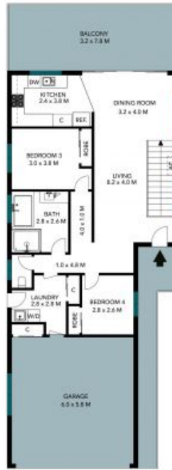
LOWER LEVEL 1