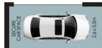
Basement Parking Level 1

The site plan and floor plan are not to scale, measurements are indicative and in metres. Bushes and trees are placed for illustration purposes. Plans should not be relied on. Interested parties should make and rely on their own enquiries. All other information provided has been collected from reliable sources but cannot be guaranteed for accuracy.