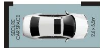
Basement Parking Level 1