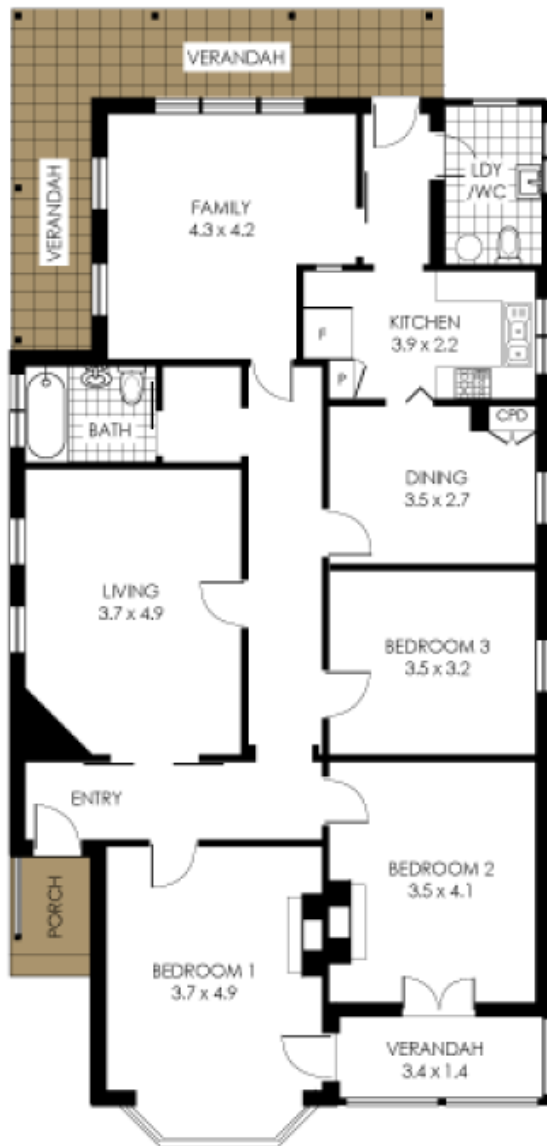
HOUSE FLOOR PLAN