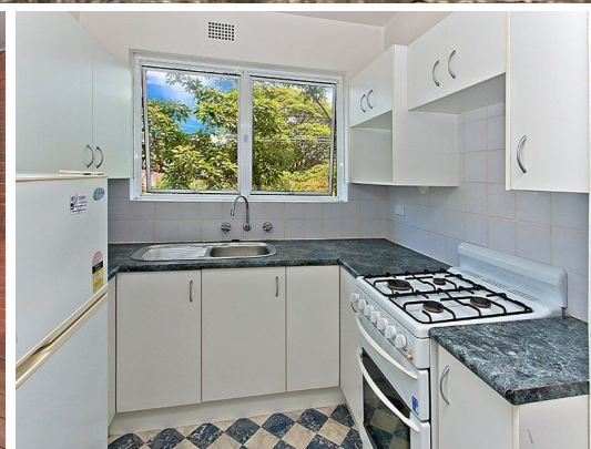
8/31 Heydon Street MOSMAN, NSW 1 1 1