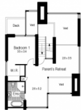
LEVEL 4 FLOOR PLAN

Disclaimer: Notice is given that all dimensions, descriptions, and details are provided in good faith and are believed to be correct. Whilst all care has been taken in the preparation of the information contained herein no warranty is offered or implied. Interested parties should therefore rely on their own enquiries and must satisfy themselves in all respects.