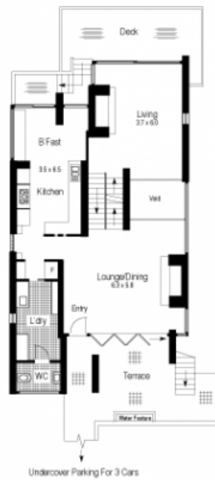
LEVEL 3 (ENTRY) FLOOR PLAN