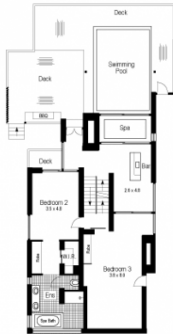
LEVEL 2 FLOOR PLAN

Level 1 Floor Area = 55m 2 approx. Level 2 Floor Area = 215m 2 approx. (incl. decks) Level 3 Floor Area = 175m 2 approx. (incl. deck + terrace) Level 4 Floor Area = 70m 2 approx. (incl. deck) Total Area = 515m 2 approx.