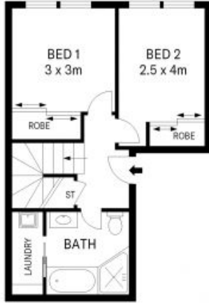
FIRST LEVEL (SECOND FLOOR)