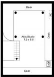
Atto (Above Studio) Upper Floor