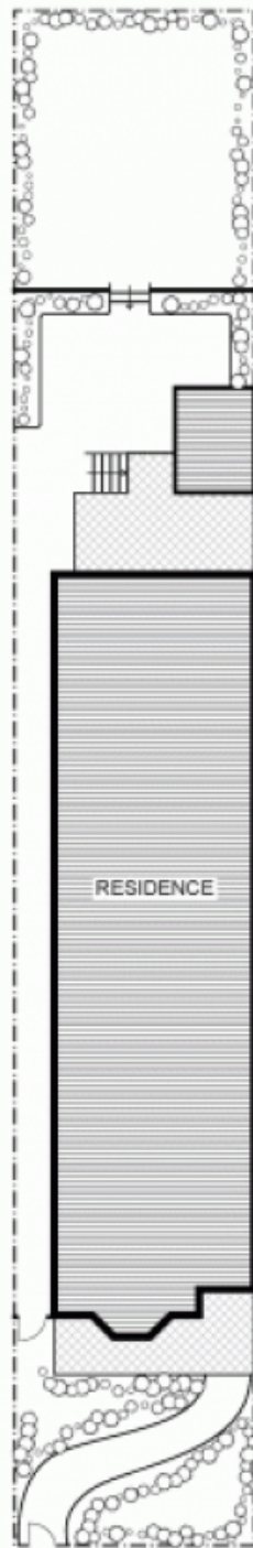
SITE PLAN (NOT TO SAME SCALE)