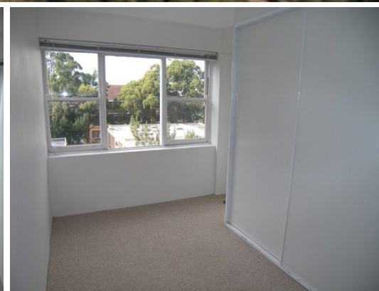
28/2 Lindsay Street NEUTRAL BAY, NSW 1 1 1