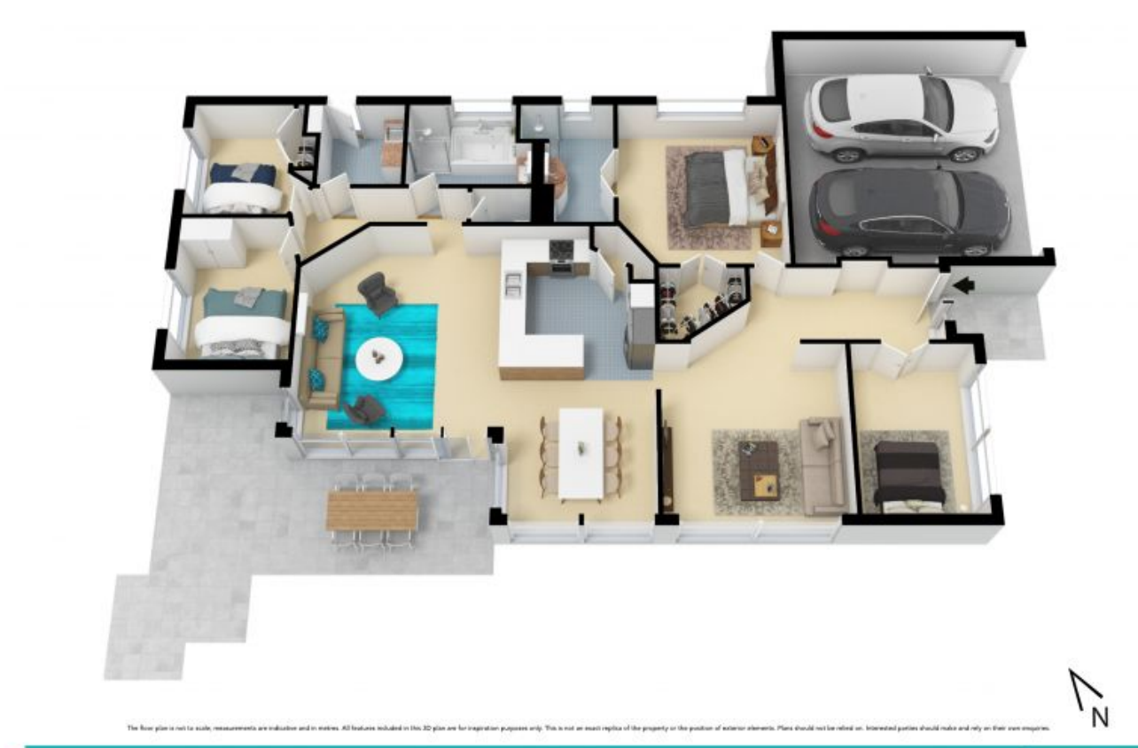
180 Warnervale Road, Hamlyn Terrace