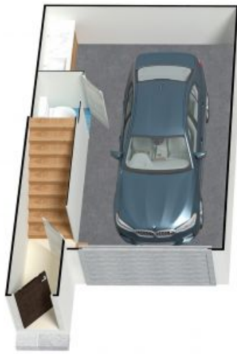
↑ Ground Floor